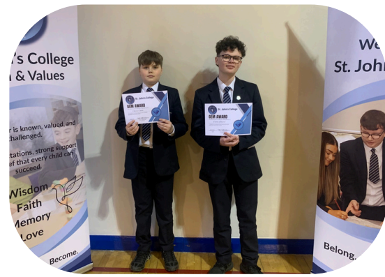
Going the Extra Mile Award winners!