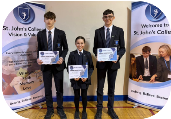
Community Representation Award winners!