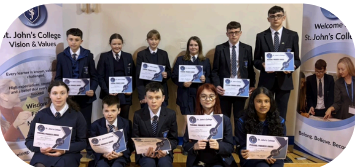
Personal Progress Winners!