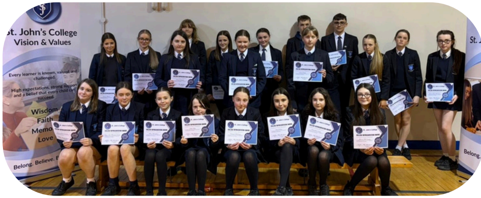
College Representation Award winners!