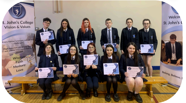
Academic Excellence Award winners!