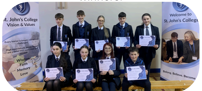
Academic Progress Award winners!