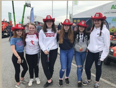
The girls looking smart in their cowboy hats