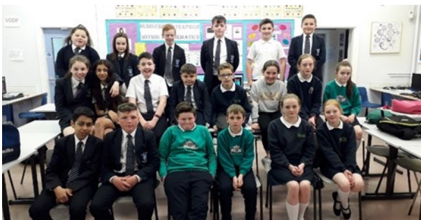
WEB DESIGN GROUP