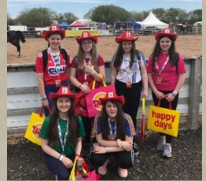
The girls enjoying the horse riding