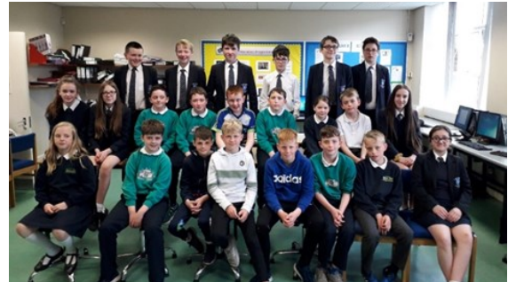
PRESENTATION SOFTWARE GROUP