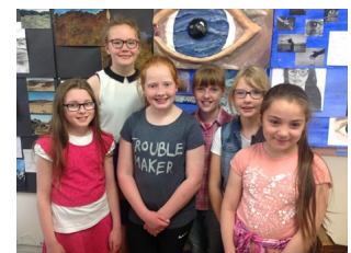
P6 and P7 pupils from St Dymphna's PS also got a chance to see the work on display