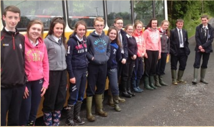
All booted up and ready to go!

On Monday 22 nd June the year 11 Geography Class carried out a study on their local river as part of their GCSE controlled assessment. The midges on the day were horrendous from the warm clammy weather but all tests were completed. The midges were having a field day eating us – explaining why on a warm day the hoods are up!