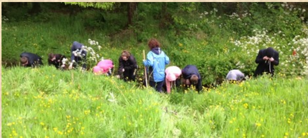
Ducking for rocks to measure length and size