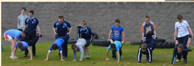
Year 8 boys getting ready for the wheelbarrow race.