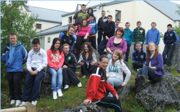
The gang enjoying a well deserved rest after walking up 150 steps from the cave floor

On the 11 th of May, the Year 10 Geography class went on a fieldtrip to the Marble Arch Caves in Co. Fermanagh