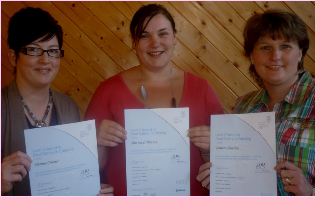
Successful candidates receiving their awards

With the help of the extended schools fund St John's was able to hold a six week basic food hygiene course. The outcomes were very successful and we hope to run it again in the new term. Skills learnt were how to prepare and cook all different types of foods in a safe and hygienic way for consumers consumption.