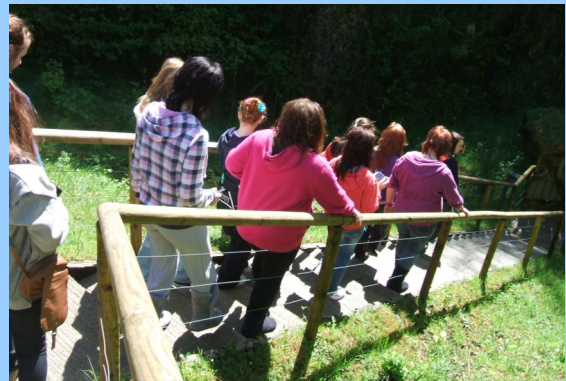
The girls on the way down into the caves