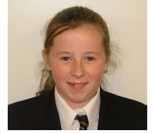
SOME OF OUR YEAR 12 STUDENTS IN YEAR 8! LOADS MORE PHOTOS INSIDE THIS SPECIAL EDITION