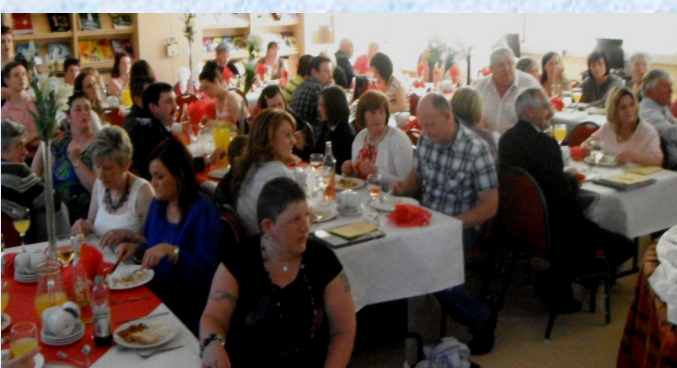
Parents and students enjoying the wonderful meal prepared by the Home Economics Department in the school.