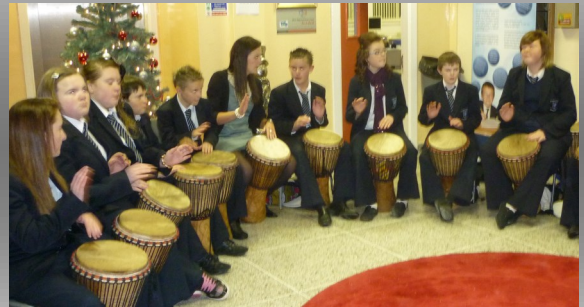
Drumming at the Fashion Show

This term we are offering the following classes to the community, Basic Hygiene Certificate Level 2 Online and Creative Writing commencing Monday 14th March 7 - 9 pm. Anyone interested in participating in the classes please contact Martina on 02882898284.