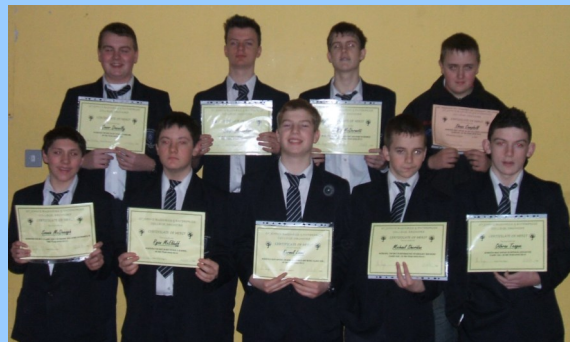
KS3 Top Boy and Best Effort of 2009-2010