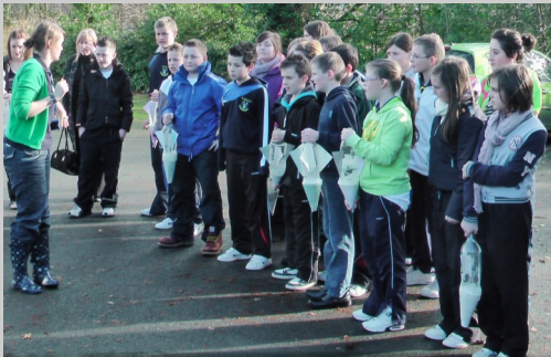
The students get ready to launch their own rockets into space!!