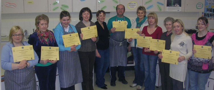
Healthy Eating Cookery class

The Extended Schools Programme offers FREE activities for our pupils and after school night classes for the community. In the first term members of the community successfully completed an 8 week 'Healthy Eating' Cookery Class and a 10 week 'Recreational Wall Tiling' class. Pupils participated in the 'Modern Dance' classes and 'Drumming' classes offered in the college. At present pupils are attending swimming lessons at Omagh Leisure Centre and the Gardening Club.