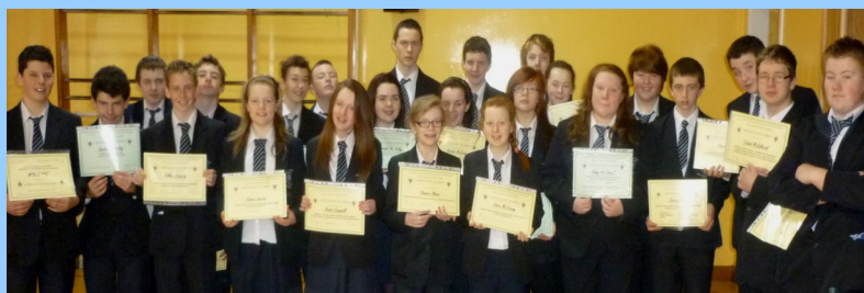
Year 9 Top Girl, Top Boy and Best Effort of 2009-2010