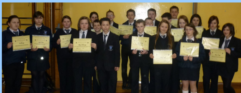
Yr 8 Top Girl, Top Boy and Best Effort of 2009-2010