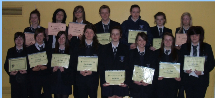
KS3 Top Girl, and Best Effort of 2009-2010

On the 11 th of February students in the school were presented with the Key Stage certificates of 2009-2010 for Top Girl, Top Boy, Best Effort in each subject area. Congratulations to all who received the certificates.