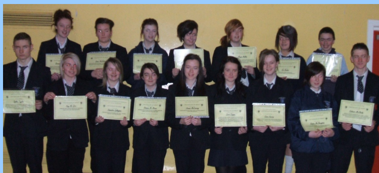
KS4 Top Girl, Top Boy and Best Effort of 2009-2010