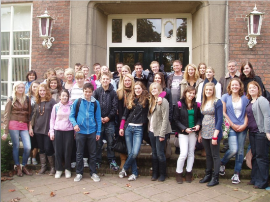
Pupils from St Johns, Devenish and Moeller College in Waalwijk