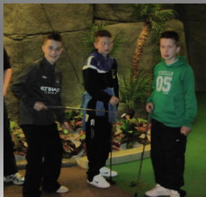
The boys try their hand at a bit of crazy golf!