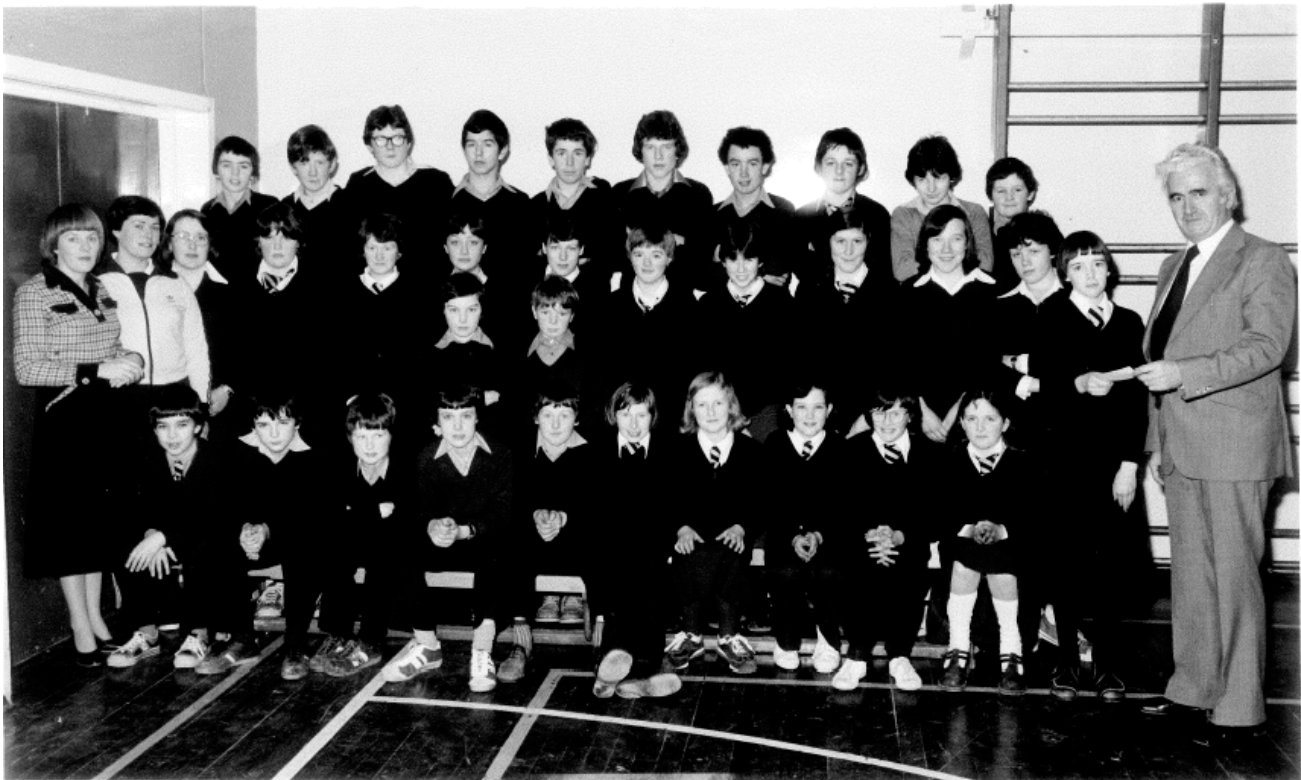
FUND RAISING FOR THE THIRD WORLD IN 1980