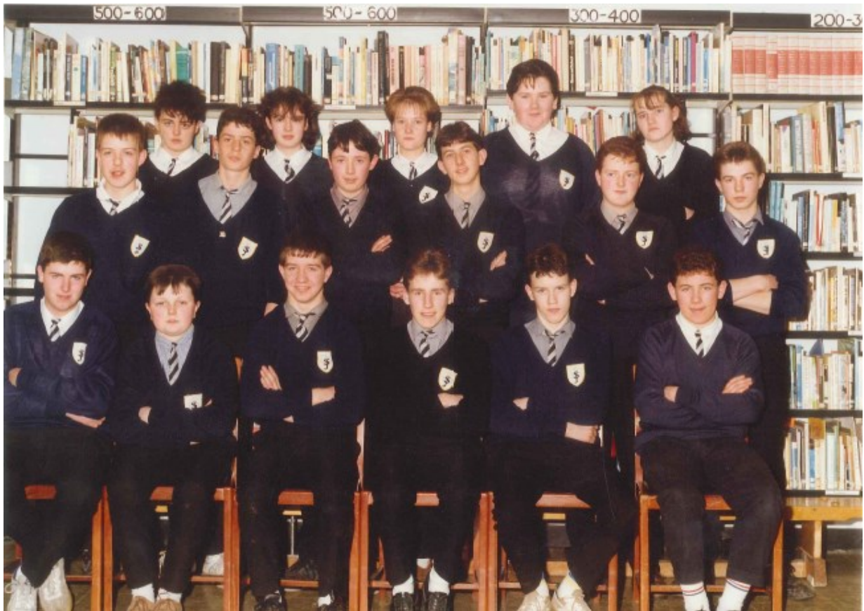
This class photograph was taken in September 1989