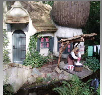
Some the attractions at the fun park, Efteling