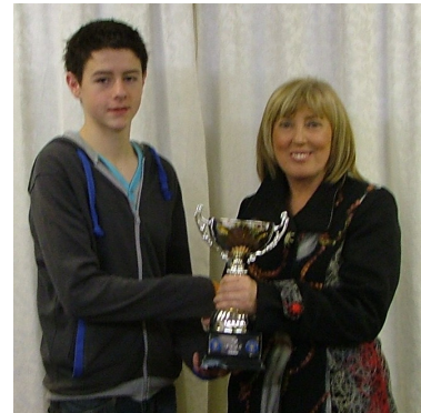
TOP GCSE BOY STUDENT OF THE YEAR 2009