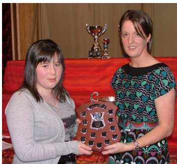
PRINCIPAL'S AWARD FOR SUSTAINED EFFORT 2009