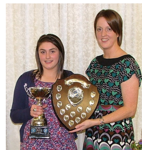
Contribution to School Life 2009