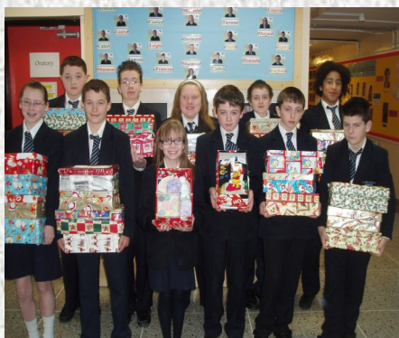
Year 9 students with some of the shoe boxes donated by the school

Well done to all students and staff in St John's who gave their help in whatever way they could to the Shoe Box Appeal 2009. This was definitely a whole school initiative and the handing over of the shoe boxes proved a really enjoyable experience. Also to add to the shoeboxes, a collection was run and £40 was raised by pupils alone to assist with the postage of the boxes. Many thanks to all parents/guardians who donated items as well.