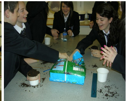
Year 10 girls mix compost and grass seeds