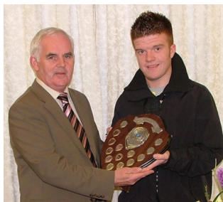
SCHOOL TO WORK STUDENT OF THE YEAR 2009