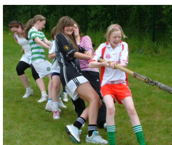
The girls' tug-o-war team!!