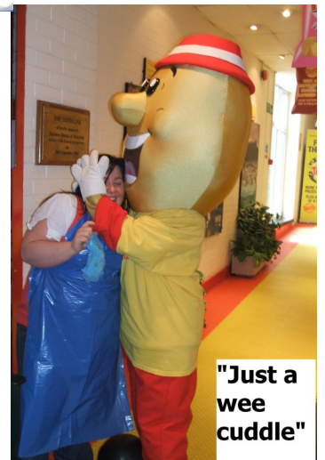
"Just a wee cuddle"