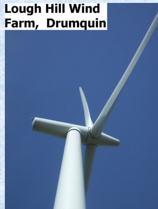
Lough Hill Wind Farm, Drumquin