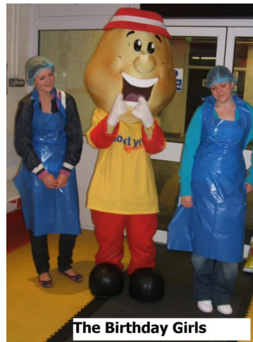
The Birthday Girls