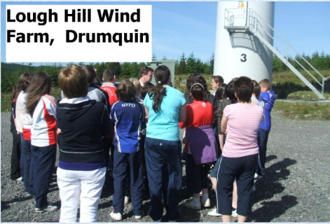
Lough Hill Wind Farm, Drumquin