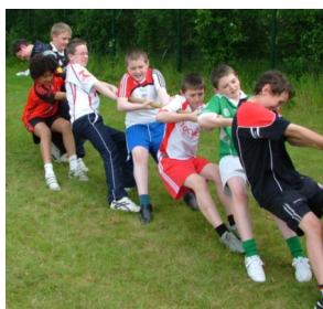
The boys' tug-o-war team!!