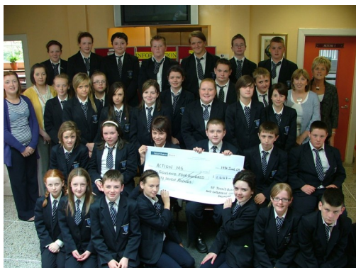
Year 8 & 9 raised £1447.00 for Action MS