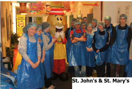
St. John's & St. Mary's