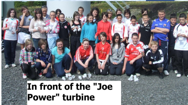
In front of the "Joe Power" turbine