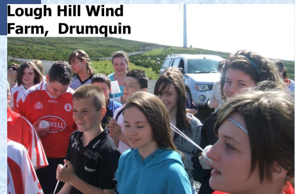
Lough Hill Wind Farm, Drumquin