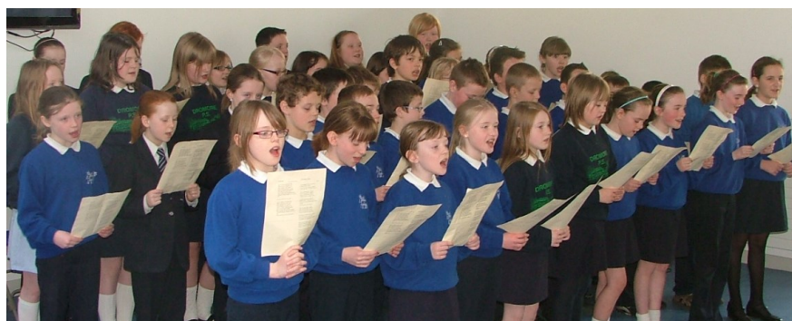
The Cross Community Choir consisting of students from Dromore PS, St Dymrna's PS and St John's B & E College