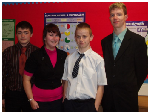
Students all suitably dressed for their interviews on the day