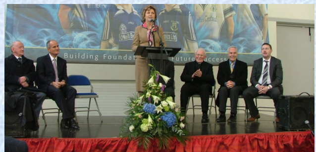
President Mary Mc Aleese addresses the large crowd in Dromore Sport Complex.