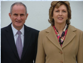
President Mc Aleese and her husband Dr Martin Mc Aleese arrive at Dromore Sports Complex

In her speech President McAleese commented on the number of great football players that had been provided by St Dymphna's GAA and past students of St John's Business & Enterprise College who now take up their proud places on both the Tyrone Minor and Senior Teams. After the event tea, coffee and sandwiches were served by St John's.