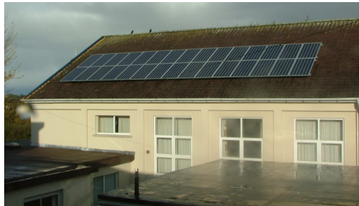
This Solar Panel was installed after Easter this year onto the gym roof. We have already made savings as well as reducing the amount of pollution going up into the air (nearly 1000kg of CO2).