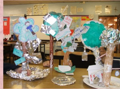
Year 11's Enterprise Trees