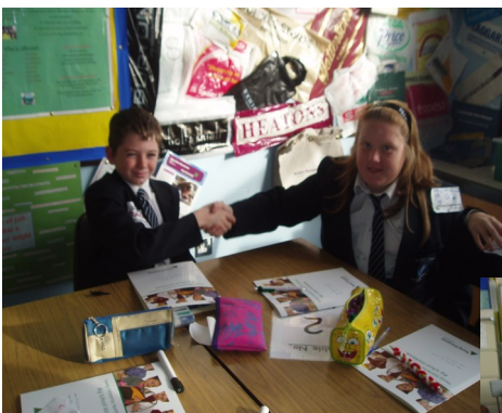
'How to greet each other' in business'