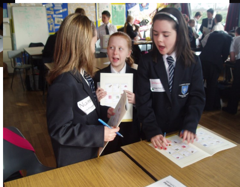
'Talking and listening to each others' ideas'