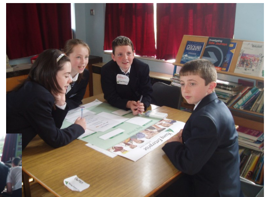
'Working as part of a team'