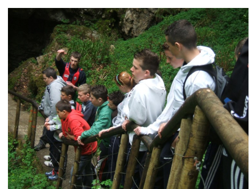
As they descend into the caves.