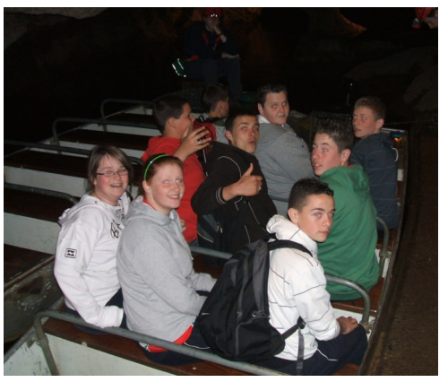
The excitement is palpable as they embark on a flat bottomed boat.