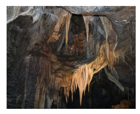
Incredible features of time seen in the caves