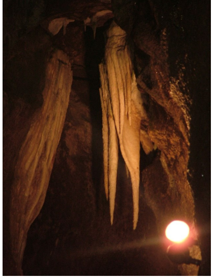
A stalactite in the cave that began to form over 100,000 years ago