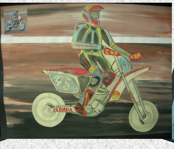
'Motorbike' Darragh McGowan