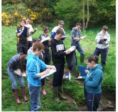
The gang recording at Carryglas Bridge