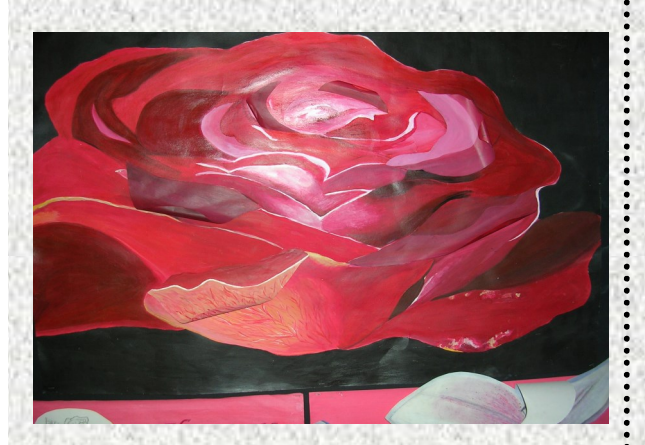
'Rose' Claire Gallagher'