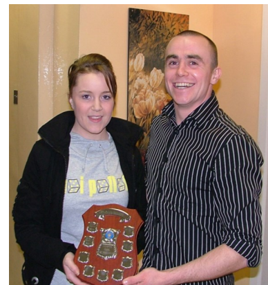
SPORTS GIRL OF THE YEAR 2007