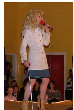
Various students performing in the Variety Acts section