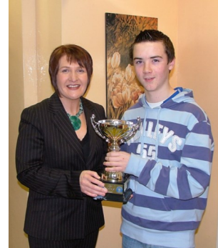
TOP GCSE BOY STUDENT OF THE YEAR