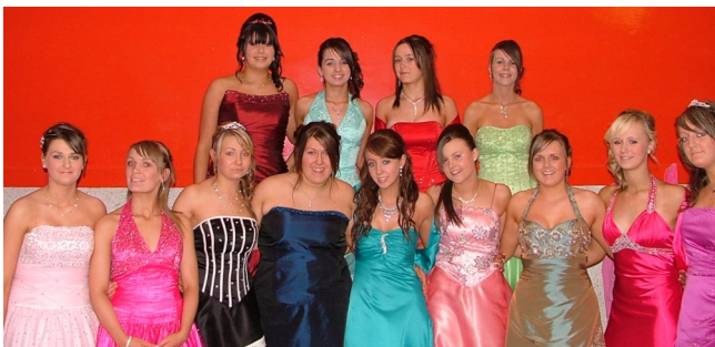
Some of the Gorgeous Girls on the night!