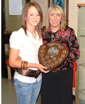
TOP STUDENT OF THE YEAR 2007