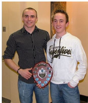
SPORTS BOY OF THE YEAR 2007