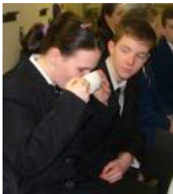
Tasting the coffee!