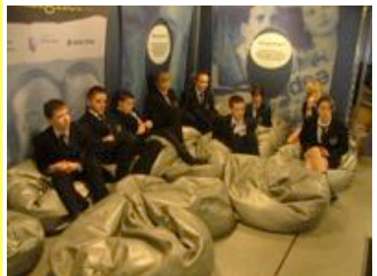
Year 10 students inside the Aim Higher Roadshow

The Aim Higher Road Show visited St John's on the 7th March 2007. The roadshow trailer is a state of the art mobile exhibition centre with cantilevered body and its own power supply. The trailer was well fitted out with a range of audio visual equipment and comfortable seating was provided in the form of beanbags for the visitors. Our Year 10 students were the guests of the roadshow and were informed of the vast range of opportunities that further and higher education can provide them. They were instructed on matters such as grants, student loans and qualifications. This visit proved to be a very worthwhile experience for a very attentive Year 10 audience.