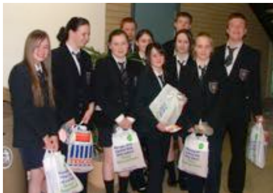
Goodie bags galore!